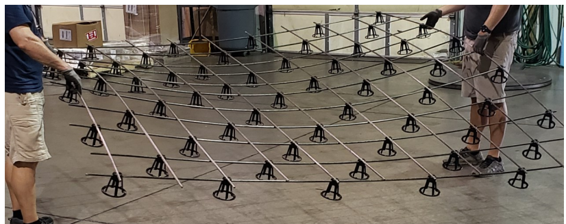
Give it a lift